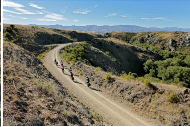
Otago Central Rail Trail: Grade 1