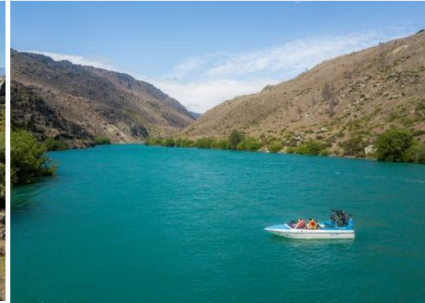
Roxburgh Gorge Trail: Grade 2-1