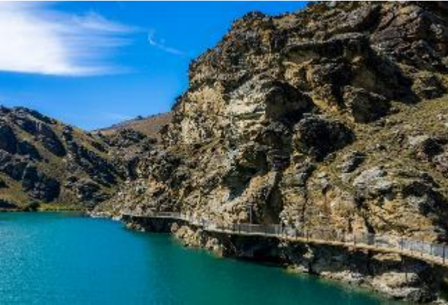
Lake Dunstan Trail: Grade 1-3