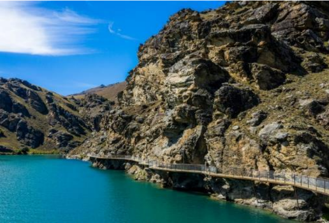
Lake Dunstan Trail: Grade 3-1