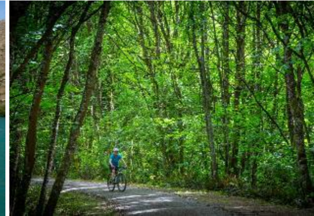
Clutha Gold Trail: Grade 1-2