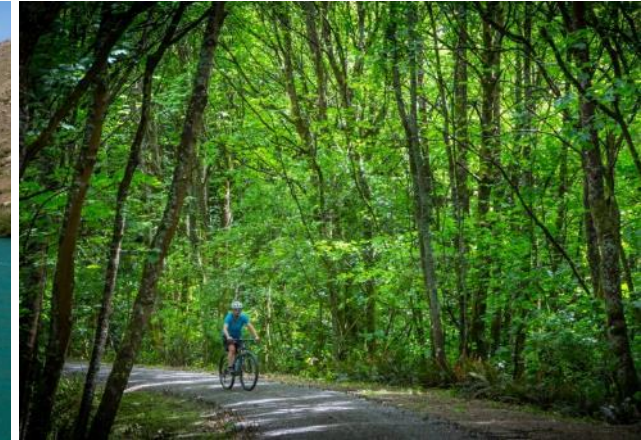
Clutha Gold Trail: Grade 3-1

Sell packaged Cycling Holidays with confidence