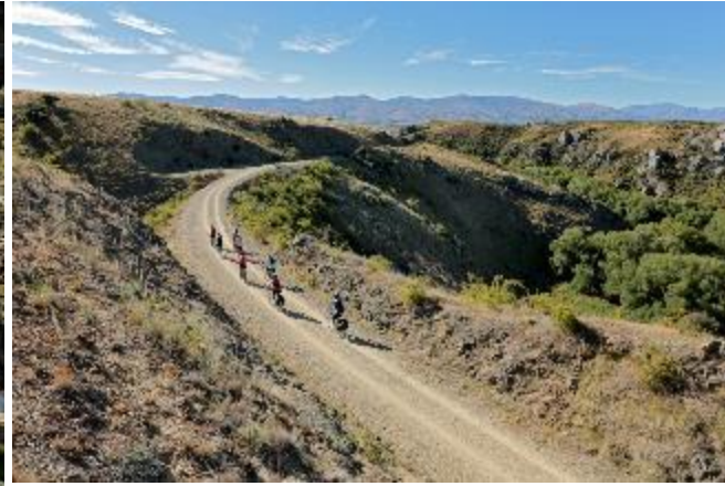
Otago Central Rail Trail: Grade 1