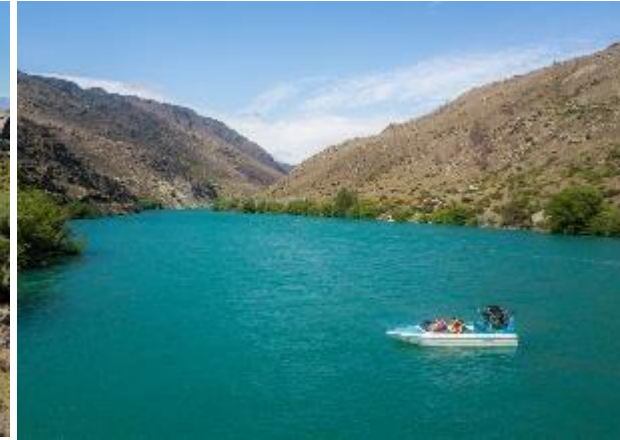
Roxburgh Gorge Trail: Grade 1-2